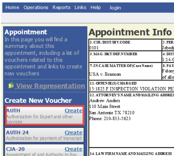
Figure 2: Appointment Info Page

In the blue Appointment section, click the AUTH Create link.